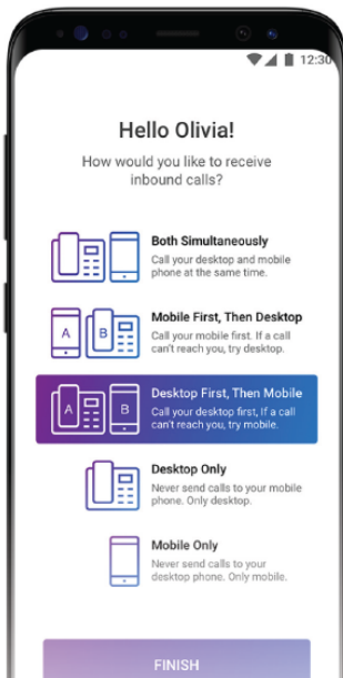
Choose A Call Strategy